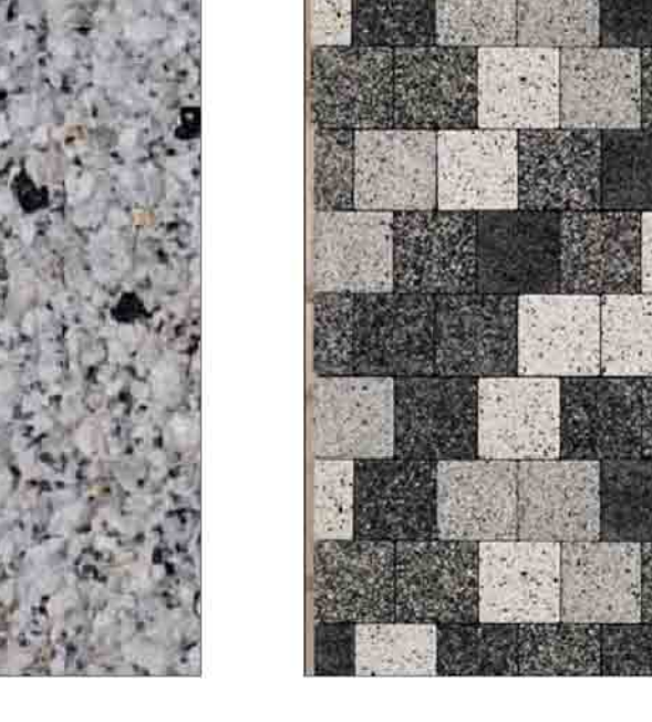
19 ZUIDTANGENT PAVER FB7C/D/F/G/H