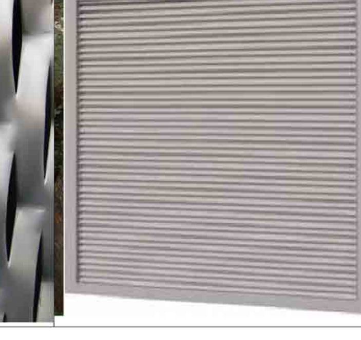
Polyester Powder coated louvre