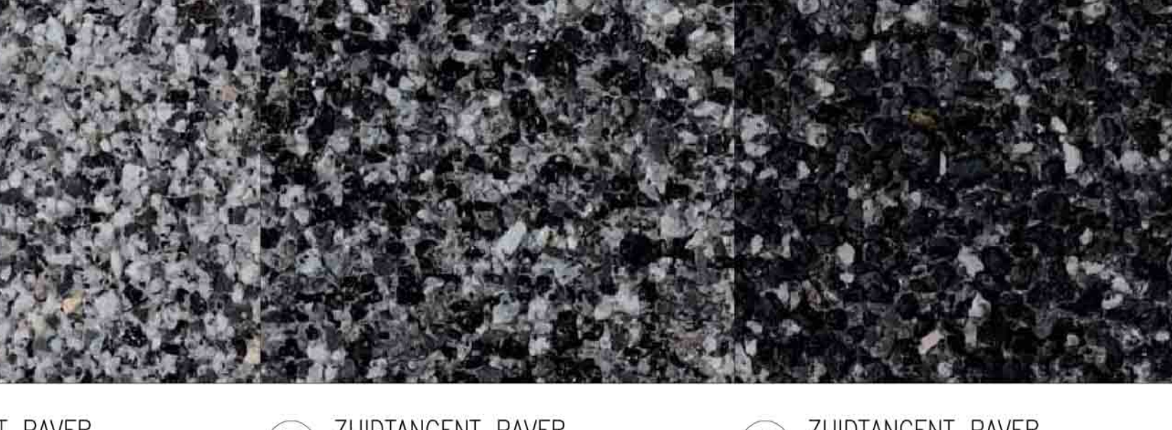
19 ZUIDTANGENT PAVER 19 ZUIDTANGENT PAVER