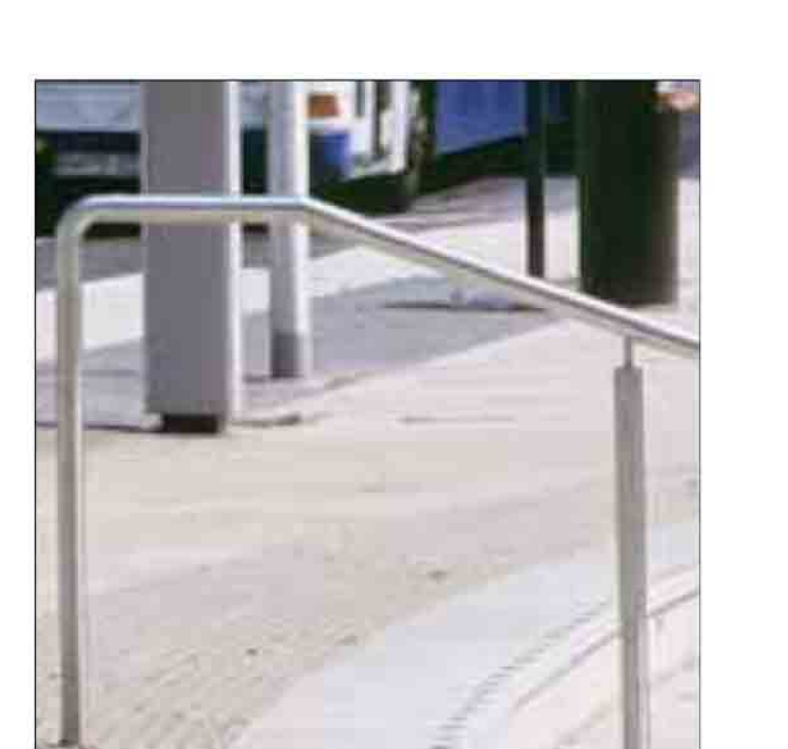
HANDRAIL W15- BRUSHED STAINLESS STEEL G:\Projects\M1004\CAD\Tp\1065.dwg By: CB Date: 24.11:11 Time: 14:56 Xrefs: Images: