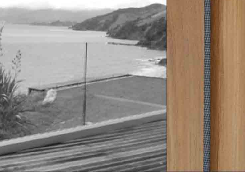
GLASS BALUSTRADE W12- toughened and laminated baluster panel inter layer to be clear, edges polished, brushed stainless steel capping and clamp fixed to balcony or paragraph.