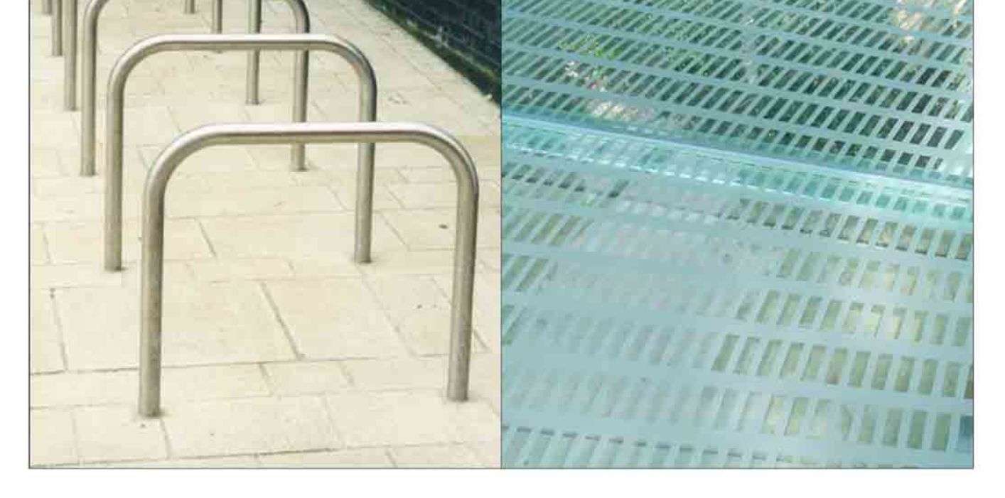
BIKE STAND BRUSHED STAINLESS STEEL 18 FRITTED GLASS